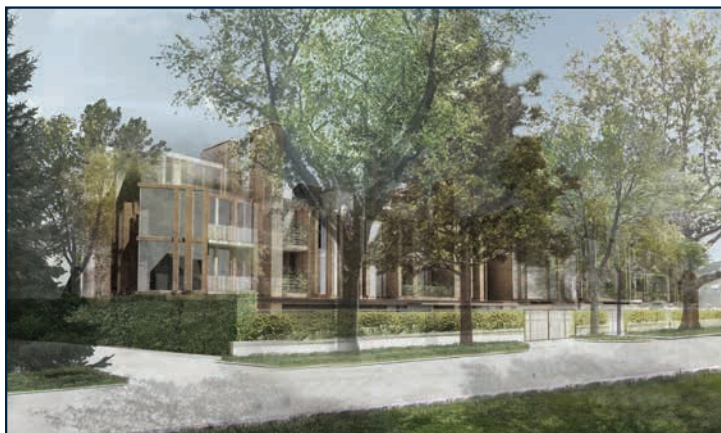
Artist's Rendering of Proposed Development