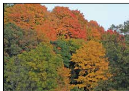
Trees in full colour make for a spectacular view from the Glen Road Bridge every fall.