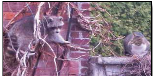
One of South Rosedale's many raccoons got into a long standoff with a cat outside a Crescent Road home

Take action now to preserve and enhance the magnificent tree canopy that gives so much beauty and character to our neighbourhood.