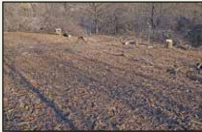
The clear-cutting of trees late last winter on the Chorley Park hill sparked a community outcry over the City's switchback trail plans.

Hundreds of local residents, including many from South Rosedale, raised concerns over a range of issues including the proposed trail's visual and environmental impact, and the extensive forest clear-cutting on the hillside that preceded the proposed construction work. The SRRRA played a key role in stopping the City-proposed plan, in conjunction with the Friends of Chorley Park and the North Rosedale Residents' Association.