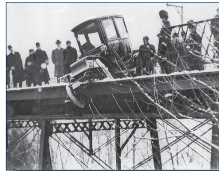
View from the past: A car almost falls off the Glen Road Bridge

More information about the consultations and community meetings will be provided by the City and SRRA.