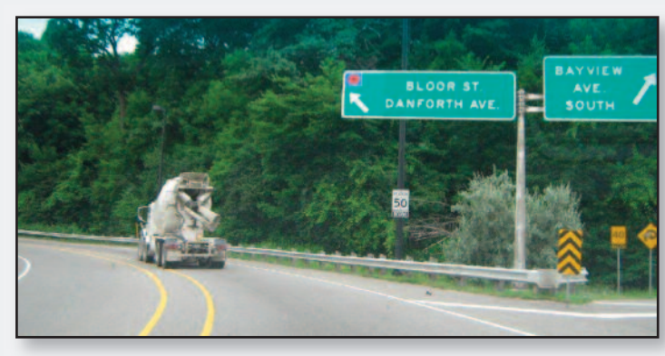
Route of Heroes sign on DVP

South Rosedale is on the path of a new ceremonial route in Toronto honouring Canada's fallen soldiers.