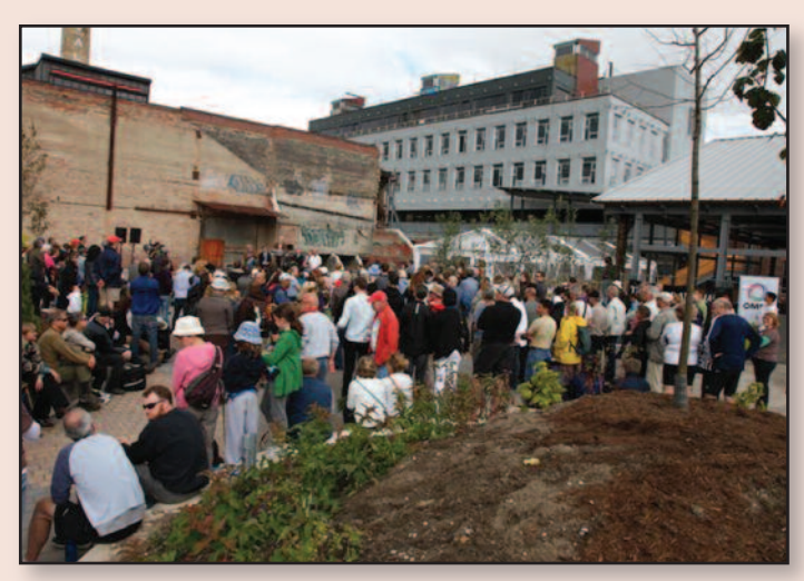
Welcome to Evergreen Brick Works